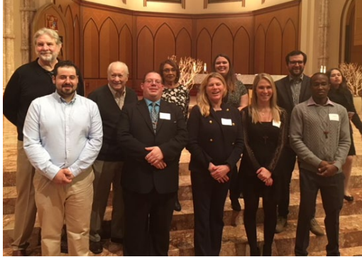
Our Elect with their Sponsors

The Adult Faith Community... supports the mission of lifelong learning by providing educational, spiritual, and formational activities for the parish and the community.