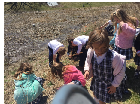
Planting more seeds in our pollinator garden.