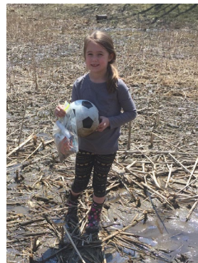
Picking up trash in the wetland.

Everyday HFCA students are caring for creation in our Outdoor Classroom.