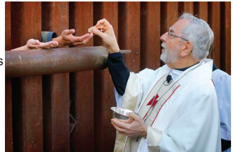
Bishop Kicanas distributes Communion through a border fence in Nogales, AZ in 2014

Migration is a complex phenomenon and for this reason, the Kino Border Initiative recognizes the importance of providing a space in which scholars and students can do research on migration and help find solutions to pressing policy issues. Past researchers have investigated topics such as service learning, nursing care for women migrants and the effects of security policies on the U.S./Mexico border.