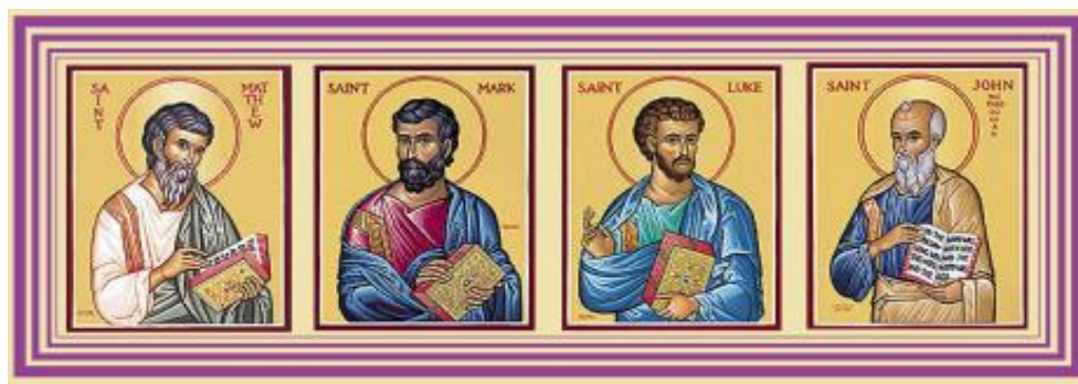
The Four Gospels