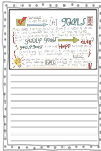
Direct teens to this graphic on TH1