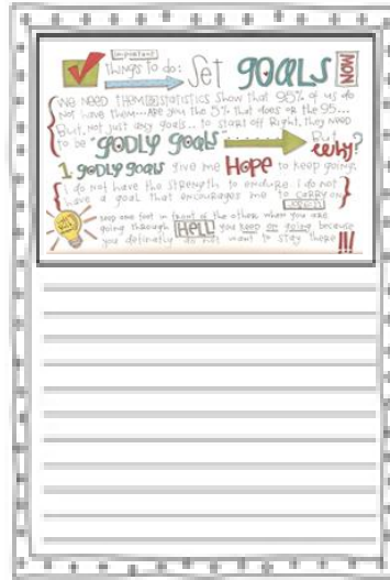
Direct teens to this graphic on TH1